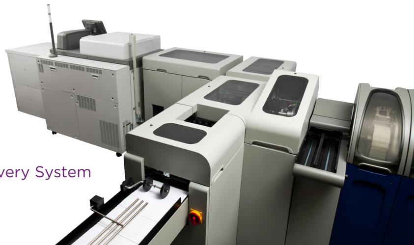
MXD610 Card Delivery System

Support market trends: Meet the growing vertical card trend without limiting job sizes based on card orientation. Dynamically place cards on carriers horizontally and vertically to meet customer requests.