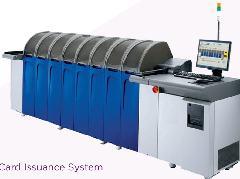
MX6100 Card Issuance System

Service and support: The MX Series Systems are supported by the industry's largest service and support network, which spans more than 150 countries worldwide. Online and phone support is available 24/7.