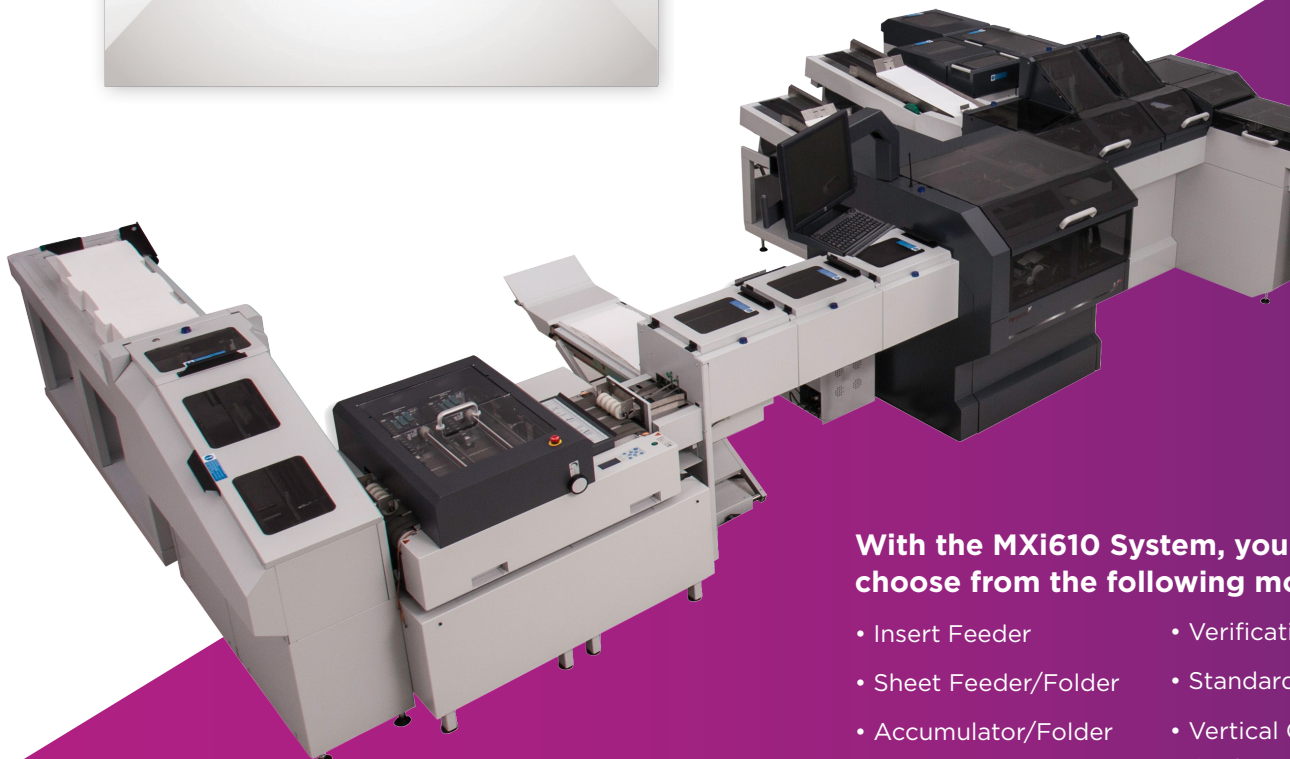
MXi610 Envelope Insertion System