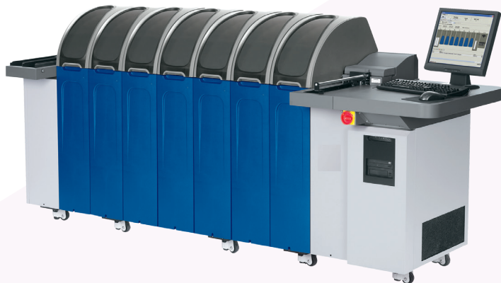
MX2100 Card Issuance System

Service and support: The MX Series Platform is supported by the industry's largest service and support network, which spans more than 150 countries worldwide. Online and phone support is available 24/7.