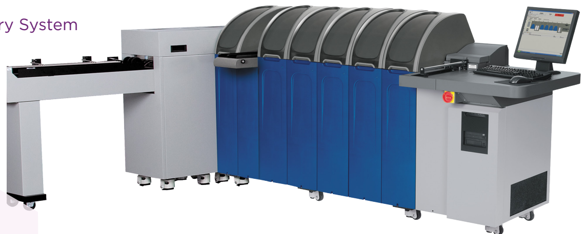
MXD210 Card Delivery System

Print-on-demand: Leverage black and white printing inline, feeding pre-printed sheets into the system.