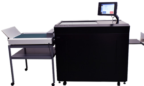
AeroCut X Pro Complete Package

*As part of our continuous product improvement program, specifications are subject to change without notice.